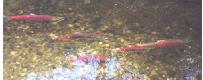
Spawning Sockeye salmon in Little Bear Creek.

Volunteers for Outdoor Washington is proud to be a part of this community effort. Please contact the VOW office for details on work parties and other opportunities for you to get involved.