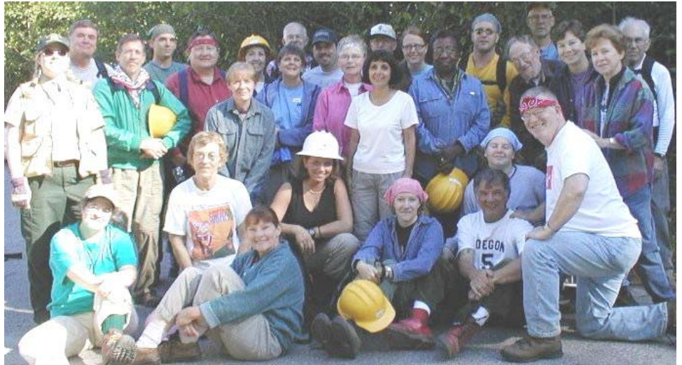
Taking a well-deserved break to say cheese during the Iron Goat Volunteer Vacation.