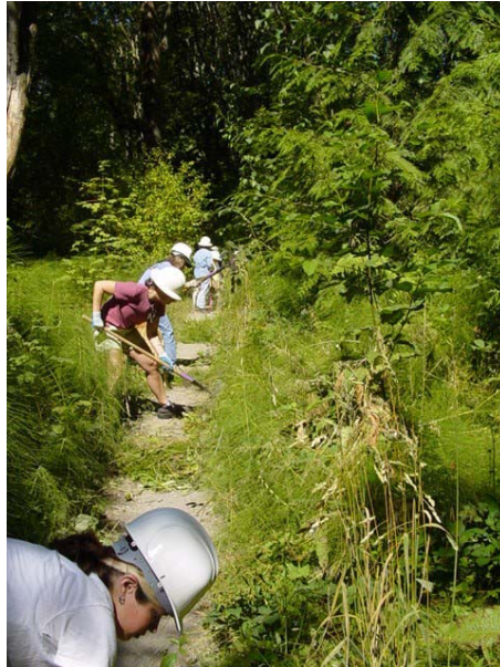
Microsoft work party, 10am

Don't know if you have a workplace giving program? Want to setup a campaign at your workplace? Visit www.esw.org for more information or call 206-622-9840.