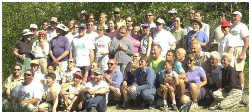
National Trails Day, 2003, on the Bandera Mountain / Mason Lake Trail. Have just as much fun (minus the mosquitoes) at our Annual Celebration!

Mark your calendar and join us for a look back at 2003 and a look ahead to 2004! Food, fun and friends. Like last year, we'll be gathering at the Meadowbrook Community Center. Please contact the VOW office for details.