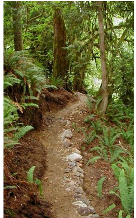
A view of the newly completed River Loop segment on the Lime Kiln Trail.