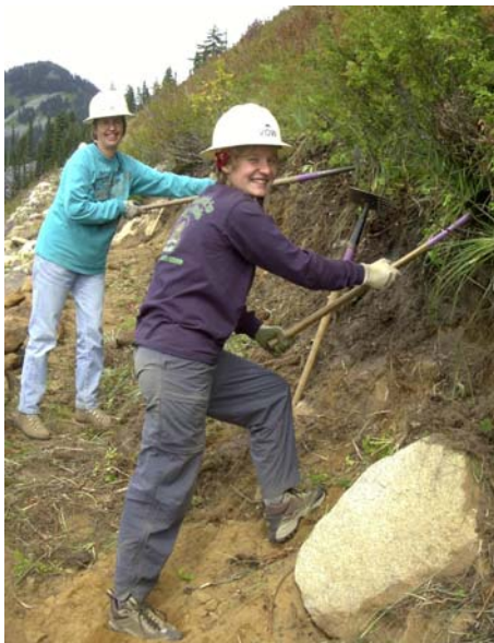
Did you know? Bandera volunteers whistle while they work. Join in!

still be on the trail in parks in Woodinville and Seattle. No hibernating for our dedicated volunteers!