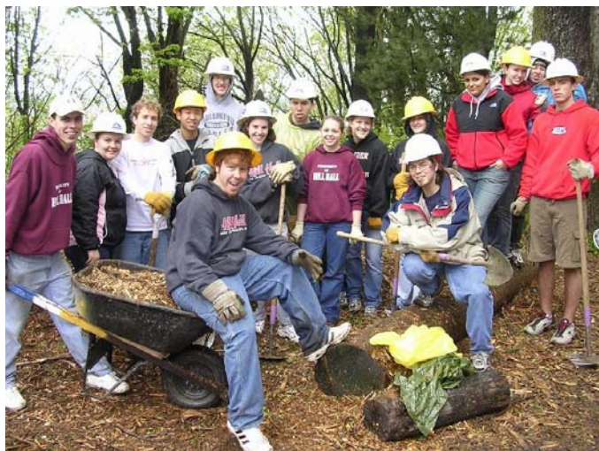
Youth group at Golden Gardens Park.

See Page 2 for the entire list of VOW's 2005 award recipients. A big thank you to these volunteers, many of them crew leaders that build and restore trails to ensure safe public access, and to REI Redmond for their ongoing support!