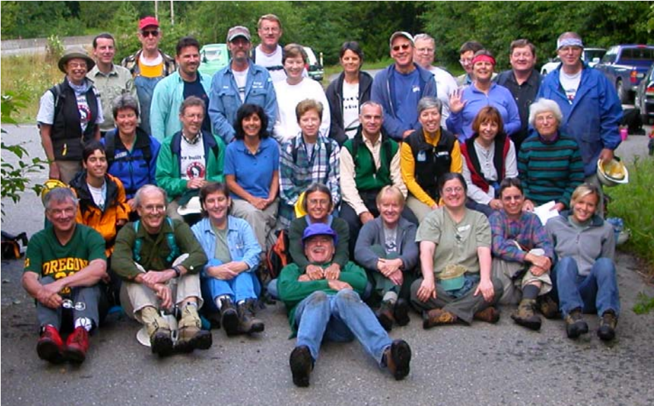
2005 Volunteer Vacationers on the Iron Goat Trail.